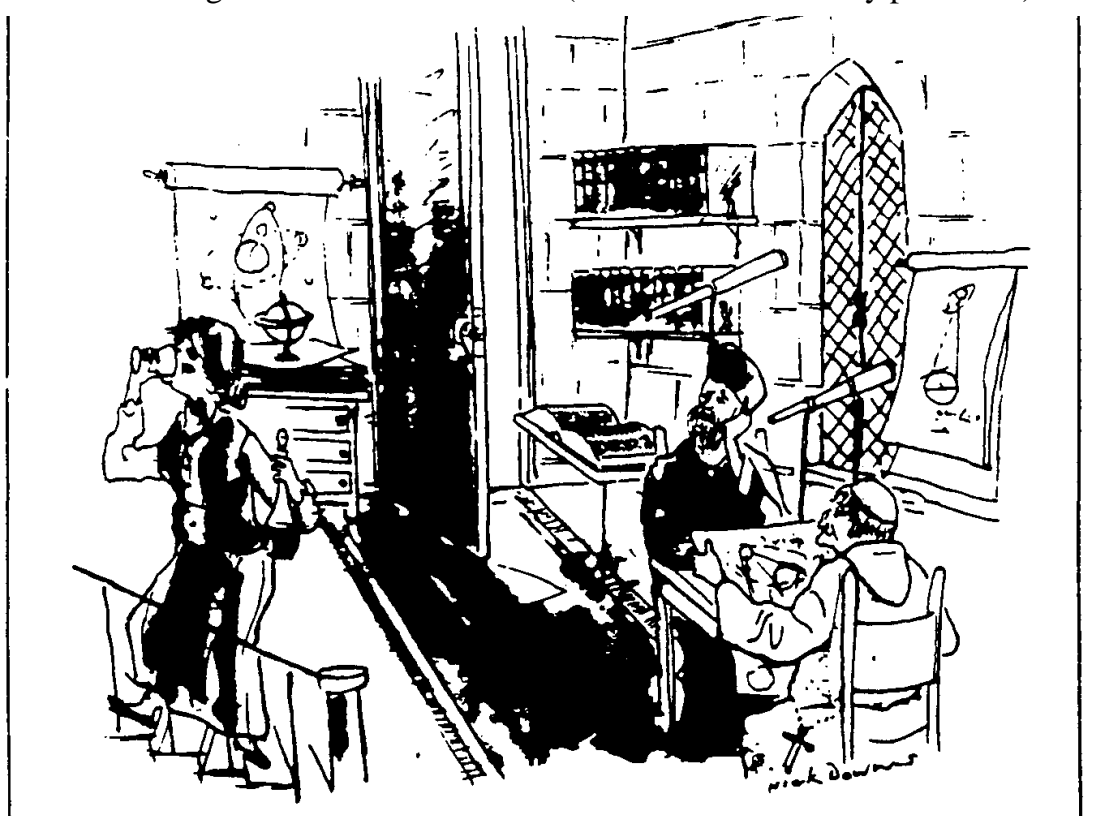
Fig. 1. Confusing objective and subjective knowledge: "There was a time when I knew that the Earth revolved around HER."

Knowledge may be about what exists; or about how things behave; or about why they exist or behave as they do. It has become common-sensically obvious that we cannot discover what exists; or, what amounts to the same thing, we cannot know whether our beliefs about what exists are true<sup>4</sup>. Thus we have discovered enough to know that electrons (and other "elementary particles")